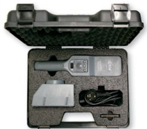
V140 CARRYING CASE WITH BATTERY CHARGER

THE SPECIAL ERGONOMIC SHAPE OF THE DEVICE ALLOWS INSPECTION WITHOUT THE INTERFERENCE OF THE OPERATOR'S FINGERS