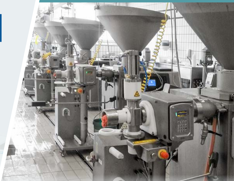
THS/PLV-MEAT21 SERIES FOR APPLICATIONS ON MEAT VACUUM FILLER MACHINES