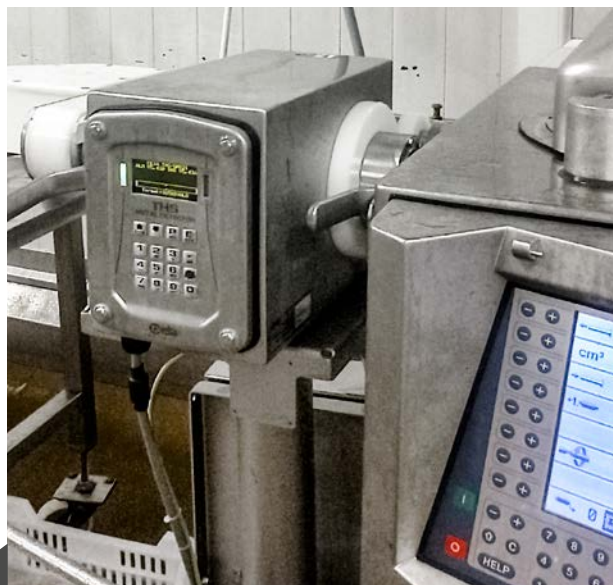
THS/PLH21 MODEL WITH INTEGRATED TWISTING EXTENSION KIT