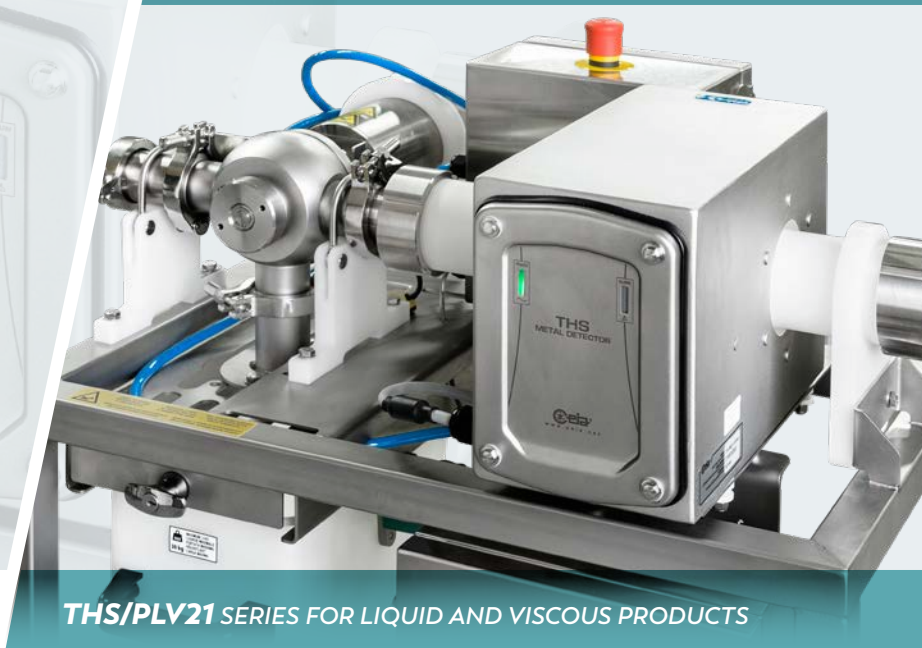
THS/PLV21 SERIES FOR LIQUID AND VISCOUS PRODUCTS