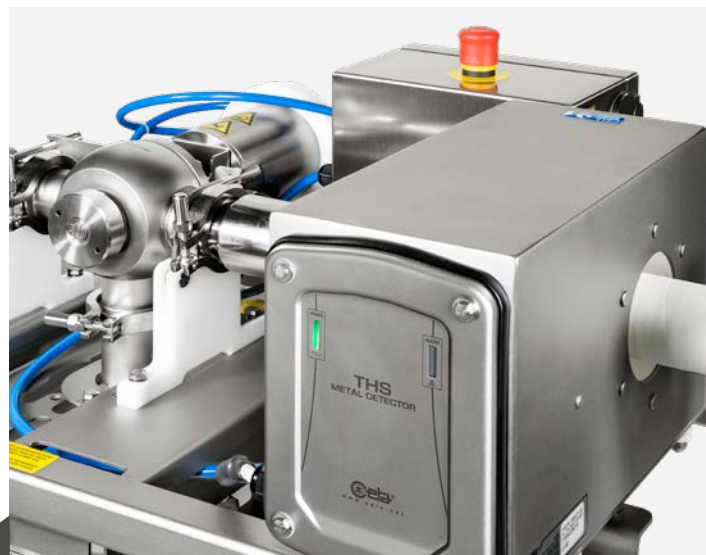
THS/PLV21-C MODEL DESIGNED TO BE MOUNTED ON CUSTOM STRUCTURES, WITHOUT THE REJECTED MATERIAL BIN