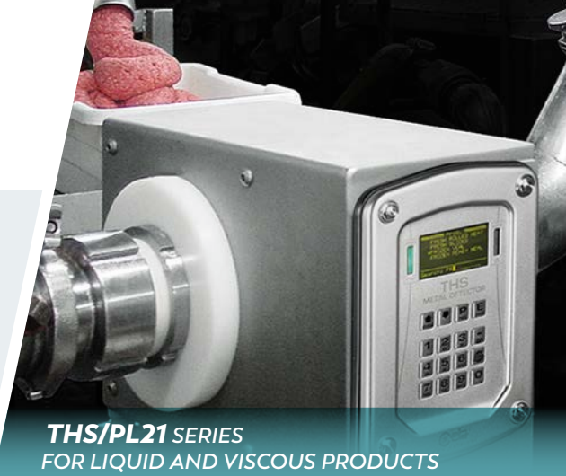
THS/PL21 SERIES FOR LIQUID AND VISCOUS PRODUCTS